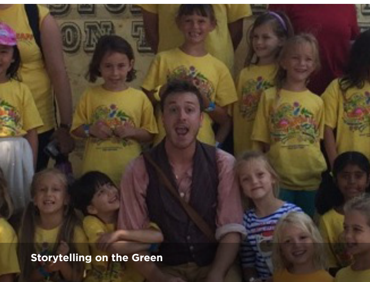
Storytelling on the Green