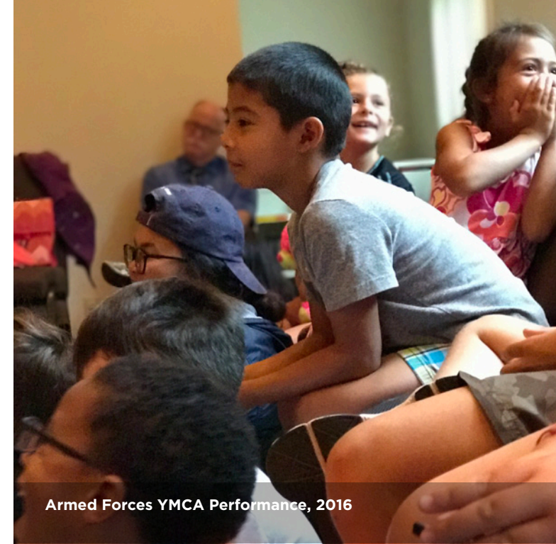
Armed Forces YMCA Performance, 2016

Audiences enjoyed a reception with the playwrights, designer showcases, and staged readings of three new works at our third annual Bill and Judy Garrett Finish Line Commission Festival. The three playwrights (one local) were each awarded a financial grant to complete their scripts.