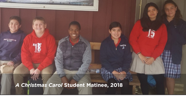
A Christmas Carol Student Matinee, 2018