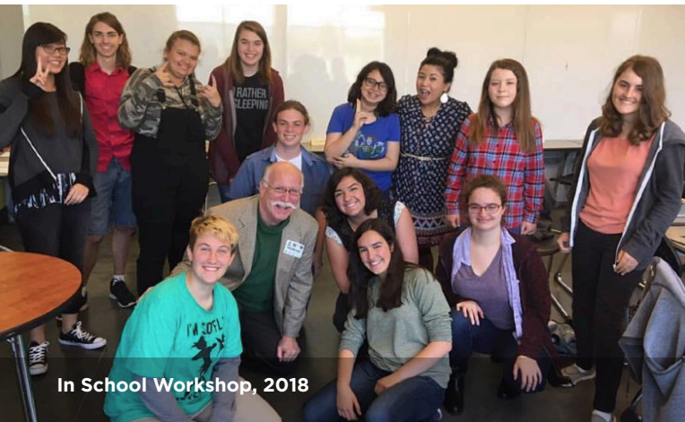
In School Workshop, 2018