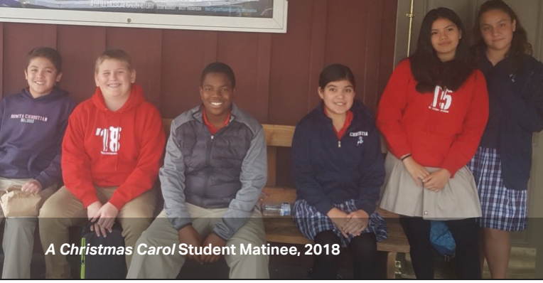
A Christmas Carol Student Matinee, 2018