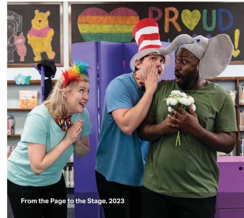
From the Page to the Stage, 2023