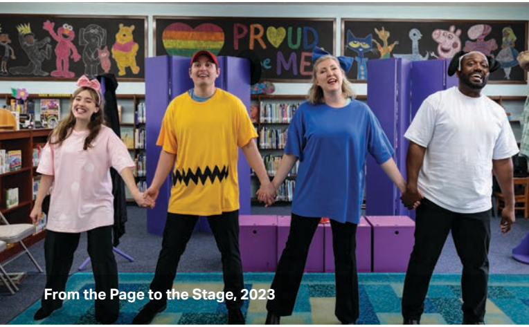
From the Page to the Stage, 2023