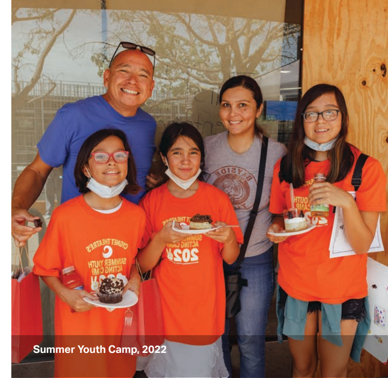
Summer Youth Camp, 2022